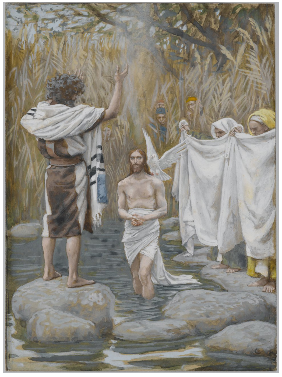
THE BAPTISM OF OUR LORD