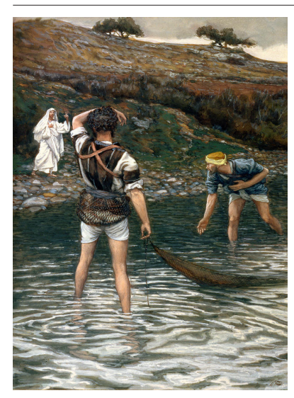
He Sees You, He Calls You