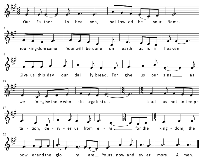
THE BREAKING OF THE BREAD

Celebrant: And now, as our Savior Christ has taught us, we are bold to sing