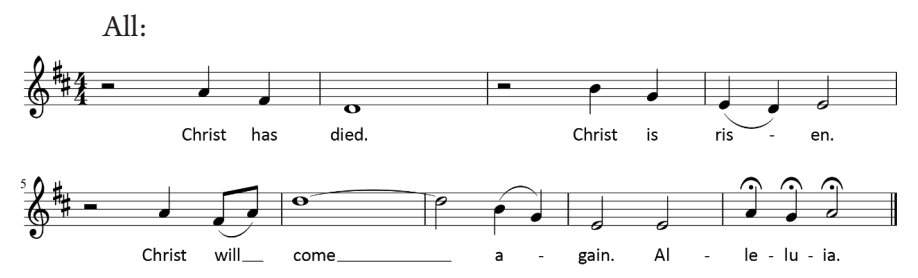
Celebrant: We celebrate the memorial of our redemption, O Father, in this sacrifice of praise and thanksgiving. Recalling his death, resurrection, and ascension, we offer you these gifts.

Celebrant: Therefore we proclaim the mystery of faith: