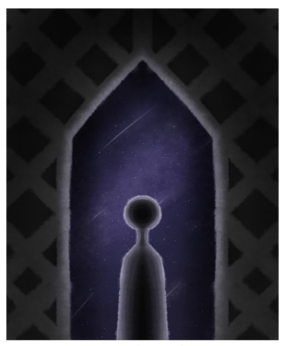
THE PRAYER LAB