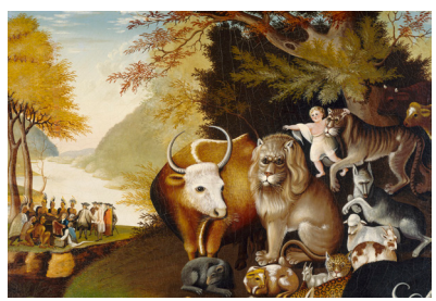
New and Improved Earth