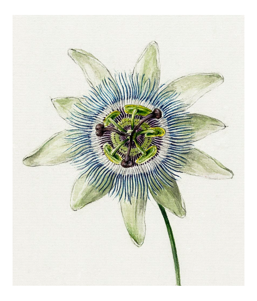
THE LORD IS GRACIOUS & COMPASSIONATE