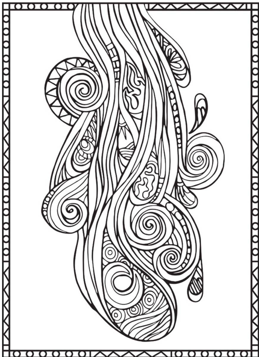
Image: Lauren Wright Pittman, Pouring of the Spirit © A Sanctified Art ( sanctifiedart.org )